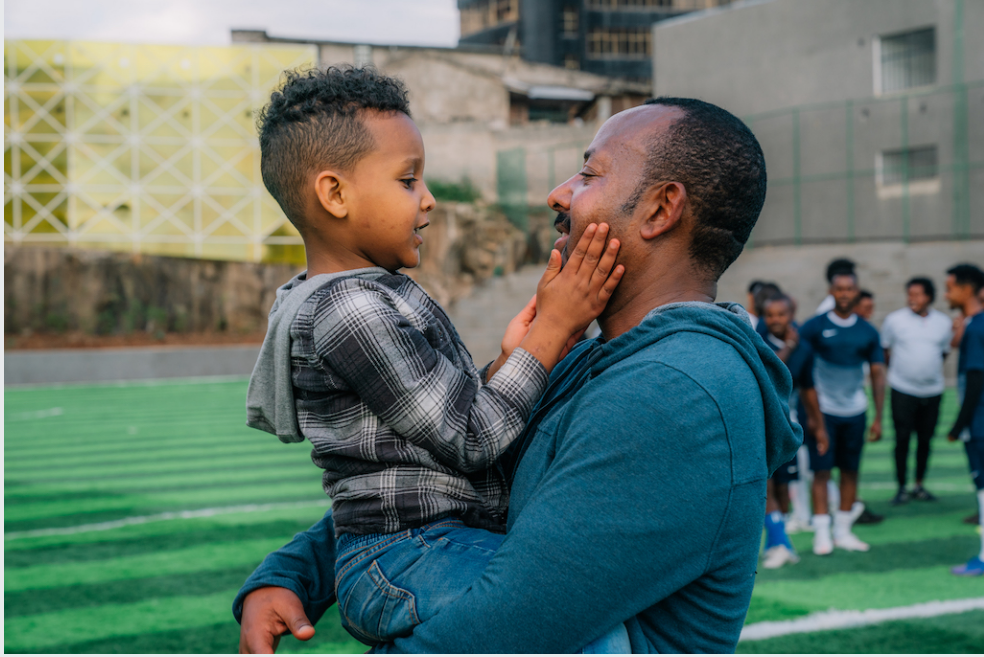
Prime Minister Abiy Ahmed and his son at a sports facility handed over by the Premiere

Copyright © 2023 FDRE Office of the Prime Minister - All rights reserved Tel.: +251 111 241161 || +251 111 241182 || P.O.Box: 1031 Addis Ababa, Ethiopia Email: info@pmo.gov.et | Lorenzo Te'azaz Road